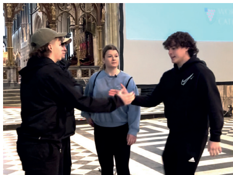
Interactive theatre from the Interchange launch at Worcester Cathedral

break the cycle of manipulation and control. Alongside the film, and for its launch at Worcester Cathedral, educational resources were designed and developed by WCRP's joint rail education scheme, Platform. Together with other stakeholders, Platform created a structure for three mini-workshops. Each workshop has an overriding theme: how gangs target; the dissonance between expectation and reality when involved with a gang; and how to access help. At the launch, interactive theatre complemented the film and workshops, and young people could also enter a design competition to create a poster showing how to access support.