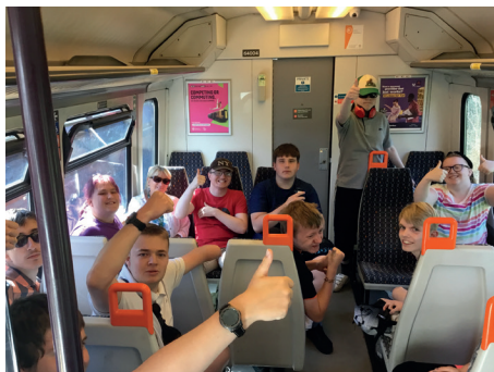
Pitcheroak school onboard a WMR train

In addition to the direct engagement of Worcestershire students, Platform have also brought 253 children and young people into Worcestershire by train from other CRP areas. For example, they have had several successful trips with bringing students into Worcester to visit the Civic Society History and Heritage Pod (Belmont School in Cheltenham travelled with the delivery team three times in May and Year 6 children from Alderman Knight School in Tewkesbury enjoyed the same trip October).