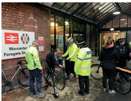
Bike Marking event at WFS Station