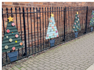
Christmas Trees at Droitwich Spa

The Friends of Droitwich Spa Railway Station created a brilliant Christmas display in December 2022. The Christmas tree festival included a bauble and Christmas Tree build and painting event where members of the local Scouts and St Johns Ambulance painted the decorations for the trees made from pallets in November 2022. The Friends have also been instrumental in securing the installation of a Defibrillator at the station in June 2022. Their tireless work to get this valuable machine installed means that passengers and visitors to the station have access to this vital safety equipment in an emergency.