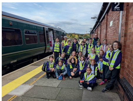
Students waiting for their train at Worcester Foregate Street Station

In addition to the direct engagement of Worcestershire students, Platform have also brought 253 children and young people into Worcestershire by train from other CRP areas. For example, they have had several successful trips with bringing students into Worcester to visit the Civic Society History and Heritage Pod (Belmont School in Cheltenham travelled with the delivery team three times in May and Year 6 children from Alderman Knight School in Tewkesbury enjoyed the same trip October).