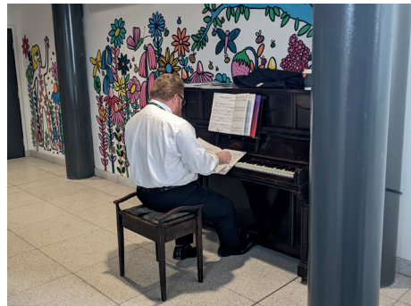
Piano installed at Worcestershire Parkway at the Wellbeing Day