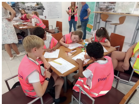
Young students learning at The Pod in Worcester

Since November 2022, Platform has delivered rail safety workshops or assemblies to 1,310 students and taken 180 children on train trips or station visits in Worcestershire. For example, they have worked with Woodrush High School to provide rail safety education to the full Y7-Y10 cohorts in March 2023. Platform also ran rail careers workshops with 344 KS2 children at Stourbridge Primary School with children attending from five different schools within the area in June 2023.