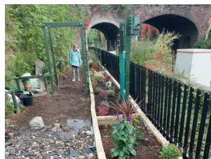
Evesham Nature Garden