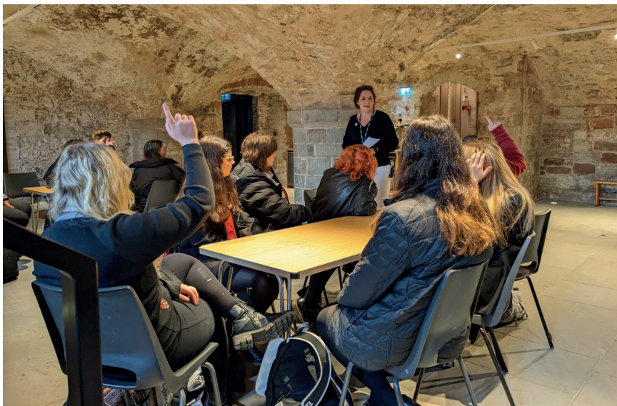
Interchange workshop at the launch

A new resource to help schools, train operators and youth workers prevent children being groomed and exploited by drug trafficking gangs has been developed in partnership between WCRP and Worcester Cathedral, Platform, the Clewer Institute, Mothers' Union.