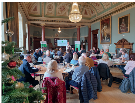
Annual Event 2022