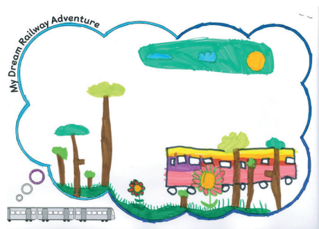
Winning design from Bethany (7)