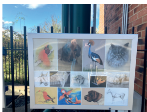
Artwork at Alvechurch