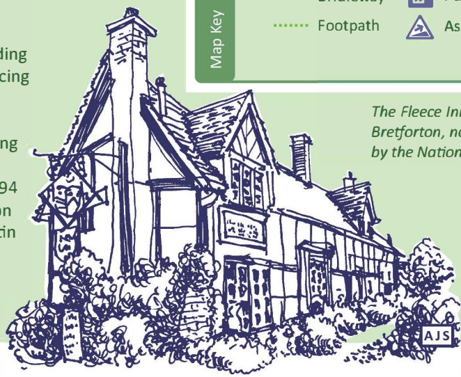
The Fleece Inn at Bretforton, now owned by the National Trust

National Trust and still operated as a local pub - albeit hosting lots of festivals across various different themes including Asparagus, Morris Dancing and folk nights. The pub and surrounding village green was also used as a film set in 1994 for the BBC's adaptation of Dickens' novel 'Martin Chuzzlewit'.