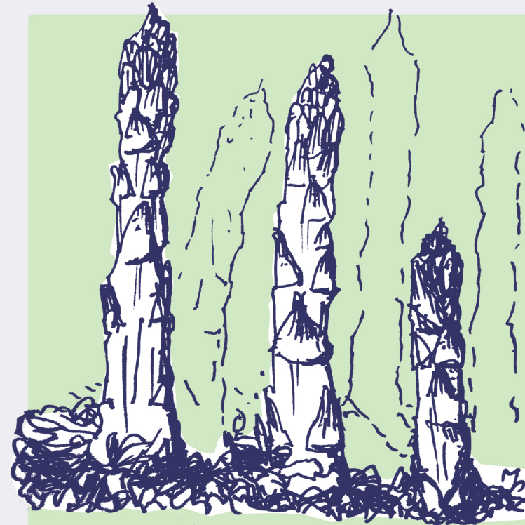
Asparagus growing in the Vale of Evesham is a traditional crop of the region and is available between April and July. The stalks grow to a maximum height of approximately 22cm.