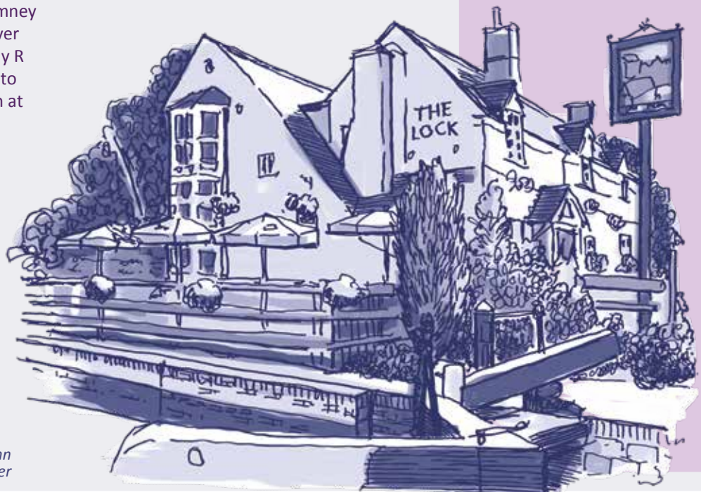
The Lock Inn north of Kidderminster

This network of waterways significantly reduced transport costs, spurred economic growth, and facilitated the rapid development of industries such as textiles, coal, and iron.