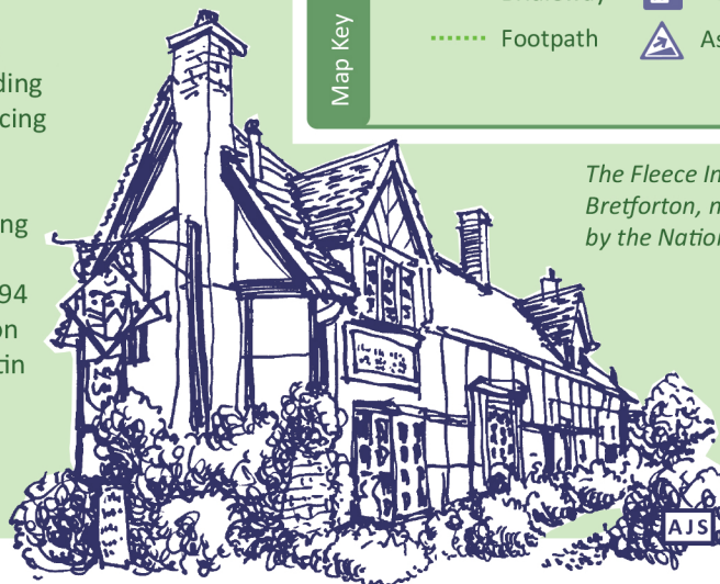
The Fleece Inn at Bretforton, now owned by the National Trust

The pub and surrounding village green was also used as a film set in 1994 for the BBC's adaptation of Dickens' novel 'Martin Chuzzlewit'.